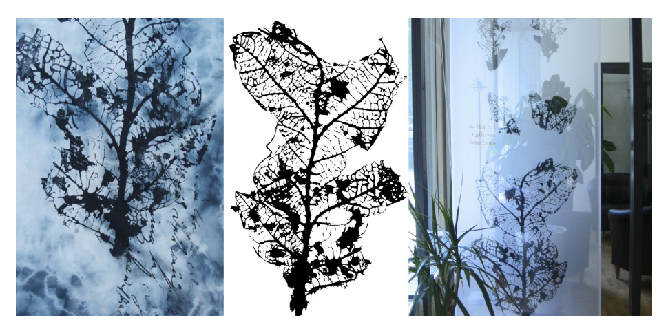
From an interior design project at Matrisen, Stockholm.